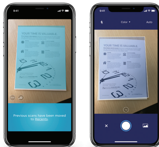
Apps like Scannable and Scanner Pro work as well as a real scanner.