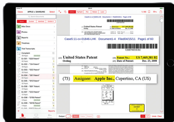
TrialPad offers callouts for key portions of documents.

Ediscovery consultant and iPad trainer Brett Burney says that iPads are the only tablet that actually make sense for attorneys. The reason is simple: TrialPad, a powerful trial presentation tool that's available only on the iPad.